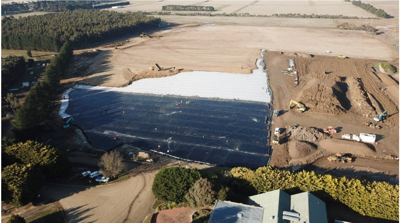
Figure 4 ISSMA July 2020

The finished containment cell measures approx. 120,000m 3 and includes an extensive leachate collection system.