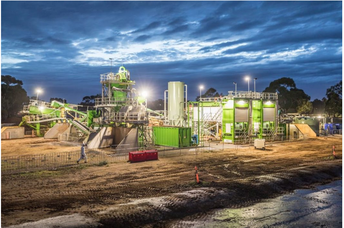
Figure 2: Ventia's PFAS soil treatment plant - SourceZone.

As SourceZone is designed to treat soils at the source of the contamination problem, PFAS is being removed from the environment at the first stage of the source-pathway-receptor process. This prevents PFAS leaching to groundwater and surface water and migrating into the surrounding environment.