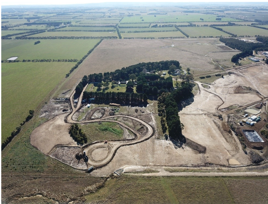
Figure 3: CFA Fiskville Remediation Project.

Rehabilitation works began in early 2019, with Ventia decommissioning the practical area drill (PAD) site, removing the training props, underground pipework and a petroleum storage system within the training area.